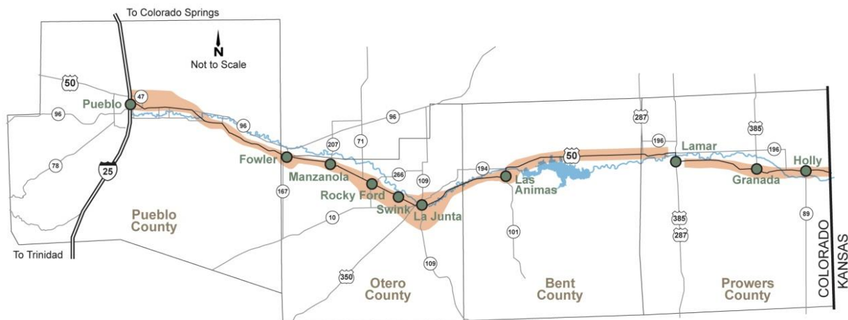
Figure 1-1. US 50 Tier 1 EIS Project Area

The project area does not include the city of Lamar. A separate Environmental Assessment (EA), the US 287 at Lamar Reliever Route Environmental Assessment , includes both US 50 and U.S. Highway 287 (US 287) in its project area, since they share the same alignment. The Finding of No Significant Impact (FONSI) for the project was signed November 10, 2014. The EA/FONSI identified a proposed action that bypasses the city of Lamar to the east. The proposed action of the US 287 at Lamar Reliever Route Environmental Assessment begins at the southern end of US 287 near County Road (CR) C-C and extends nine miles to State Highway (SH) 196. Therefore, alternatives at Lamar are not considered in this US 50 Tier 1 EIS.